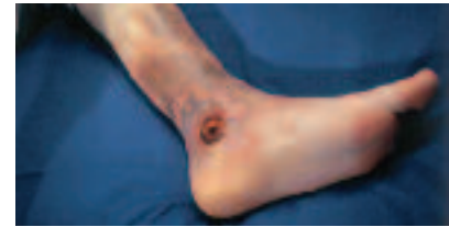
80% of venous leg ulcers are located inside the lower extremity.

The most common cause of venous leg ulcers is venous insufficiency due to failure of the one way valves in the lower leg. Incompetent valves reduce the efficiency of the muscle pumps tasked with returning venous blood to the heart resulting in venous reflux and venous hypertension. Venous hypertension increases the diameter of capillaries and alters their ability to regulate the balance of fluid, protein and cells passing into the interstitial space. Fluid balance shifts towards edema and a reduction in the delivery of nutrients and oxygen to the tissues leading to necrosis and the development of a venous leg ulcer.